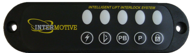
ILIS-P LED PANEL