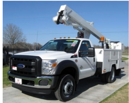
FOR WORK TRUCK VEHICLES