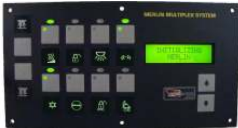
INTELEGEANT SWITCH PANEL (ISP)