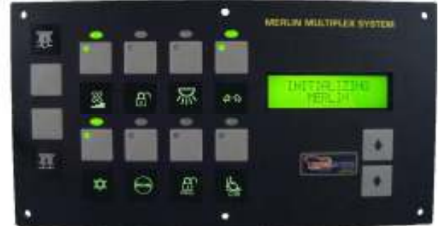
INTELENT SWITCH PANEL (ISP)