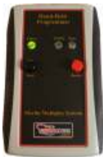
HHP HAND HELD PROGRAMMER