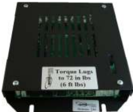
DPC8 DIGITAL POWER CENTER