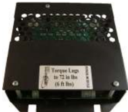
DPC4 DIGITAL POWER CENTER