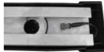
BACKSIDE OF HELP® BUMPER WITH SENSOR & HARNESS

*Warranties vary per product, please contact your dealer or InterMotive directly for specific coverage details.