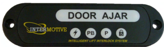
Optional HighLock Door Ajar LED Panel