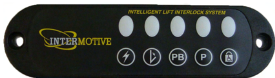
Standard HighLock LED Panel