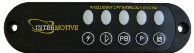
ILIS-P LED PANEL