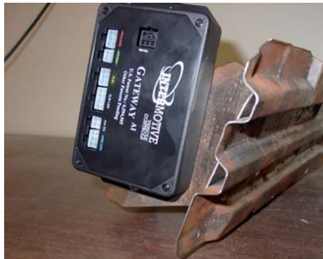
Gateway Module located on left side of driver knee bolster bracket

Action: Determine if the ambient temperature in the area of the module is at or above 150 °F. If so, determine the external heat source. This will typically be caused by engine heat if the module is mounted near the engine cover or hot air being supplied by the heater ducts. Relocate the module in an area away from the external heat sources. See photos below for suggested mounting area.